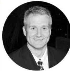
Andrew Gaze Basketball legend